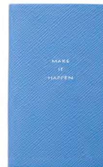
'Make It Happen' Panama Notebook Nile Blue

Lightweight and beautiful to use, our notebooks can be personalised internally with special title pages and bespoke silk or paper linings, while their leather covers can be stamped with your chosen design.