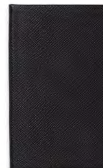
Untitled 'Add your Title here' Panama Notebook Black